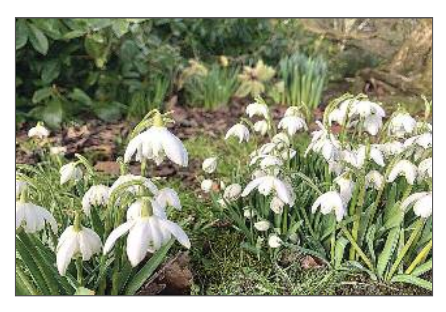
A Welcome Sign of Spring