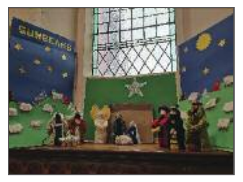
Sunbeams Toddler Group