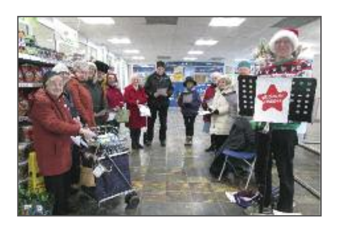
Bath Road Methodist Church and friends singing carols at the Co-op. Thank you to everyone who helped us raise £128 for Action for Children.